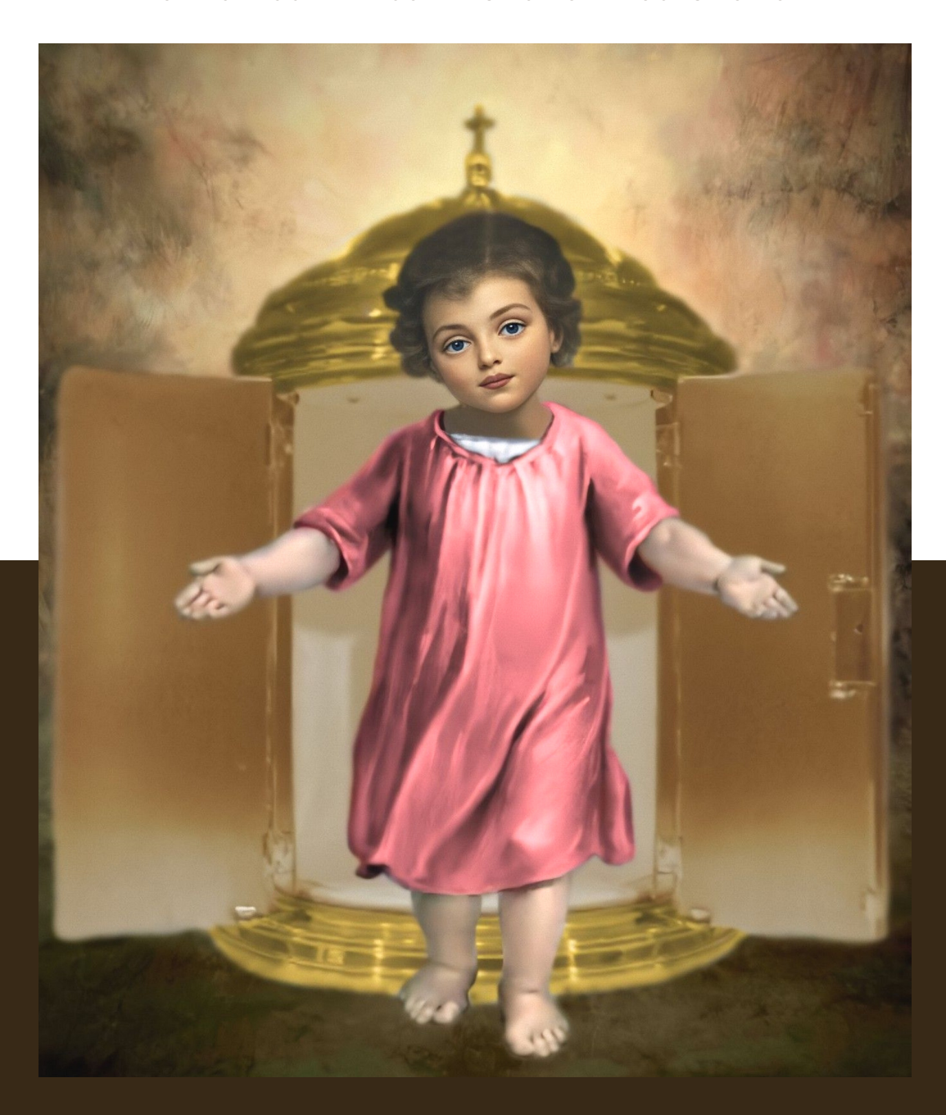
VISITING JESUS! ftep 1 - How the plan began